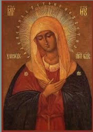
An Ikon of Mary, Mother of God

A figure on whom no other information is available in English, but whose presence is equivalent with that of Zorya, the central religious figure of Zagovory